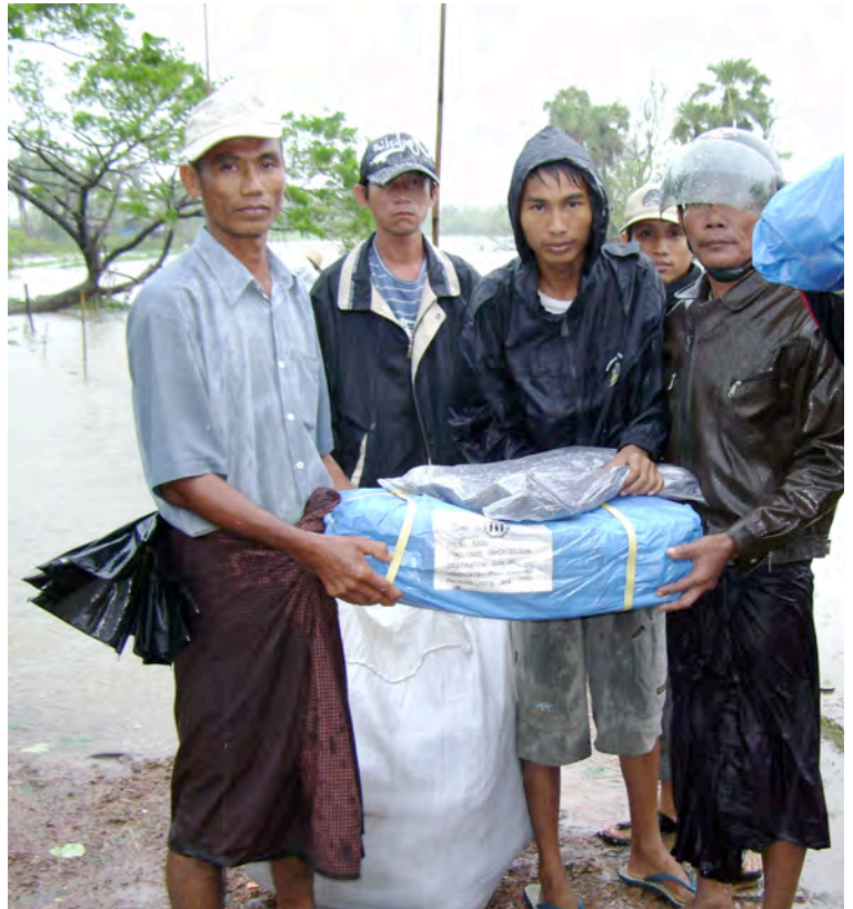
Members of the Civic Society Initiative, a local volunteer relief group being funded by the MCF, with tarpaulins for families made homeless by Cyclone Nargis

11:30am (Refreshments) 12:00pm (Presentation) International House – Davis 10 College Park